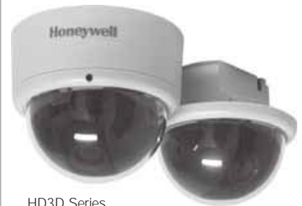
HD3D Series shown with mount ring for surface mount